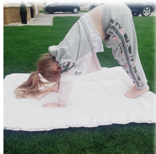
Downward Dog Pose