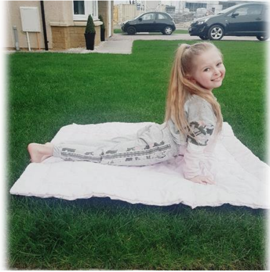
Upward Dog Pose